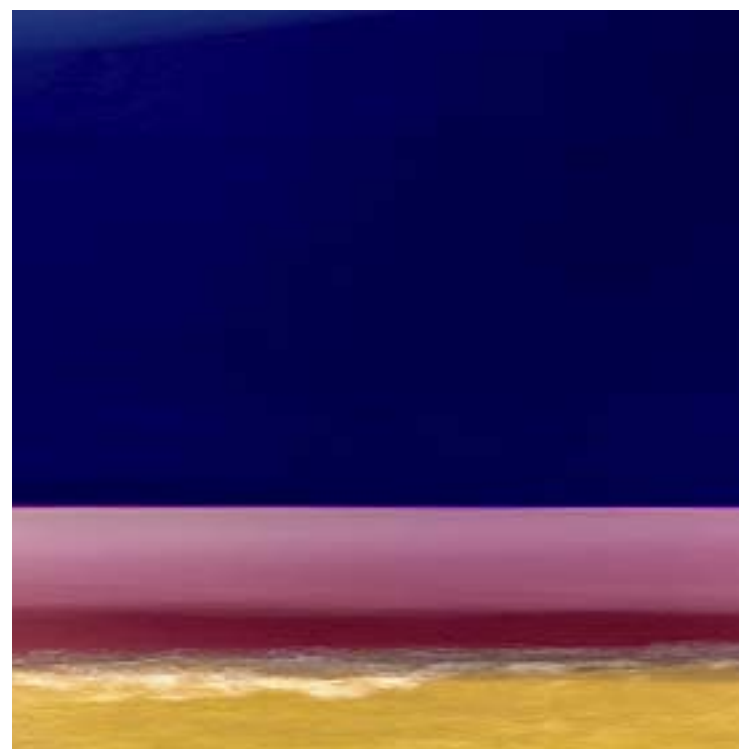
'ROTHKO' WATERLINES: Top, the Seattle Express and (above) the Hyundai Integral feature in photographer Dan Kaufman's abstract close-ups.