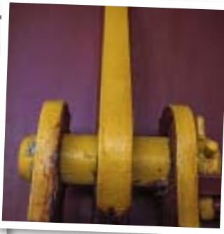
DETAILS: Above and left, from the Berlin Express .